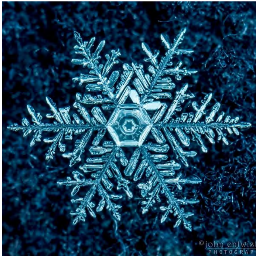
A few favorite snowflake photos | Earth | EarthSky