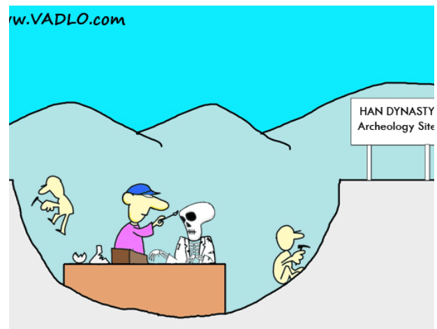
Digging remains of an early postdoc!